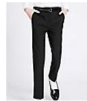
Examples of acceptable footwear [Boys]