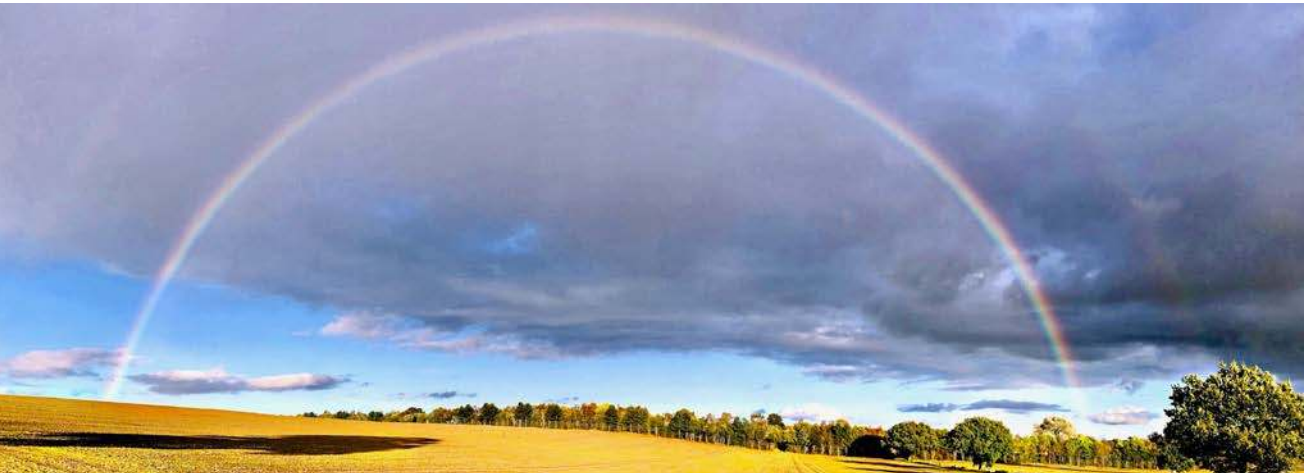
'Colours of Nature' ROTARY YOUNG PHOTOGRAPHY COMPETITION - YEAR 8 ENTRY

The importance of our co-curricular offer is reflected in its richness and diversity. From sport, music, the arts, the great outdoors, our diverse range of clubs to our varied international programme, there is something to tempt every child. Our musicians perform locally alongside professional acts, with art and photography supported by our community. Students excel in team and individual sports, and we are beginning to exploit the potential of our fabulous site. Outdoor education is deeply embedded, including outdoor residentials and DofE bronze, silver and gold expeditions. Our newly formed Discovery Society charity is building on this, with for example, an expedition to Dominica in the Caribbean. This international focus is key to our philosophy, with the school having hosed a global happiness conference attended by ten nationalities. Trips to France, Iceland, Italy, Spain and USA, also help to broaden our cultural understanding.