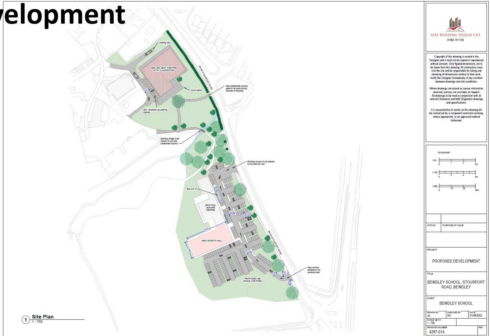
1 Site Plan 1:750