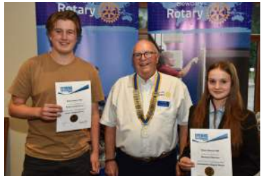
'YOUNG ROTARY PHOTOGRAPHY COMPETITION'