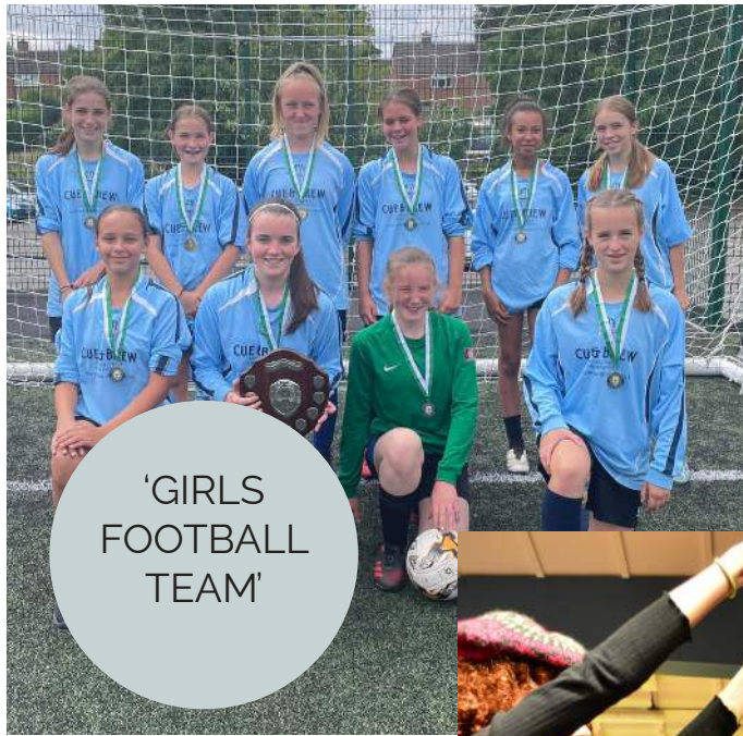
'GIRLS FOOTBALL TEAM'