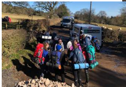
'DUKE OF EDINBURGH'